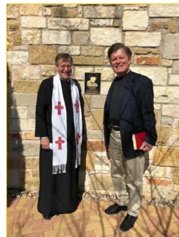
Dedication of Elsa Vorwerk's Plaque in the Columbarium.