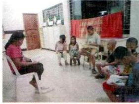
Every day children starts with prayers and devotion