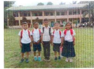
Children goes to public school