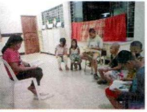
Every day children starts with prayers and devotion