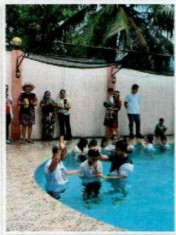
Baptism service at Christmas 2025