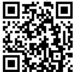
Our Website QR Code:

Last week's offering received: General Fund $2,954 Missions $195 Last week's attendance: 68