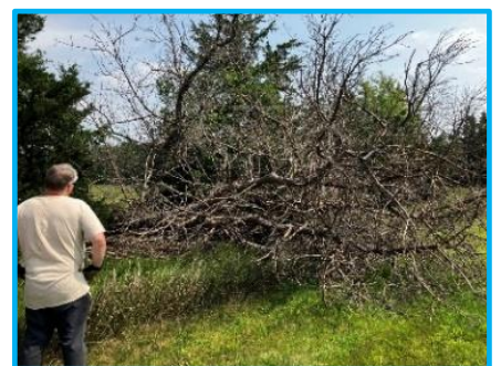
There's always work to do.

"Trust in the Lord and do good; dwell in the land and befriend faithfulness." Psalm 37:3 (NLT)