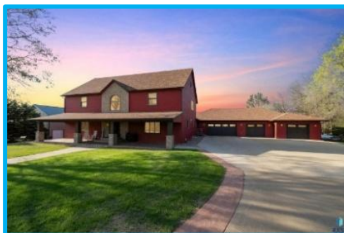
Waiting to sell.