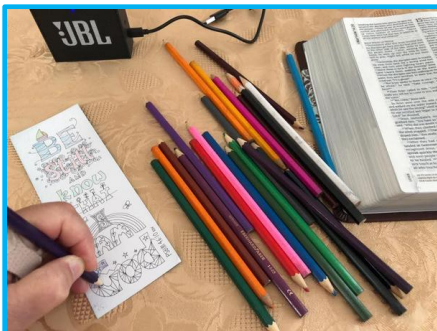
Staying in God's Word!

It might go like this: You are in a medical waiting room for a routine appointment. "In the meantime," you can read a magazine. Or write a quick note to a friend. Or pray. I am sure that many of you have daily situations that require waiting. I have been pondering "in the meantime". I know there are people waiting on a biopsy result, waiting for a prodigal, waiting for a difficult time to end, waiting for war to end. How do we wait after we've done everything we can? As one who loves Jesus and wants to walk in step with Holy Spirit, I know the answer is always to trust God. For me, what does that actually look like? Trust isn't running to idols I've crafted in my life. It's not worrying about the outcome. It isn't complaining. What do I do in "the meantime"? Some of us are good at just doing what comes next; Doing the daily things that need to get done. Unfortunately, I'm not. I stand still. In any case, we need to actively trust. Active trust is first turning to God in complete dependence on Him. It's remembering His faithfulness. It's being present in each and every moment with an expectation and hope in God for His best outcome for the future. It's believing that God will conform me into the image of His Son. (Romans 8:29)