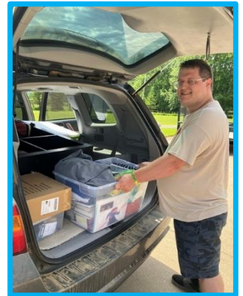
Packing back in August.