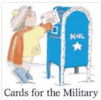
Cards for the Military

Sunday, March 31 8:30 AM, Fellowship Hall