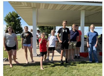
Some fierce competition was shown during the relays!