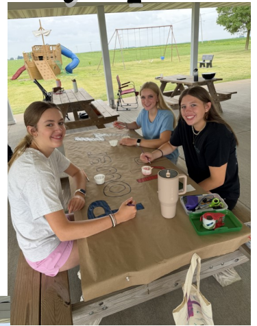
Week #1 of VBS Lesson, Craft and Possum Stew and Grits