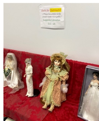
As a fundraiser, the Outreach Committee is currently selling antique dolls in the Narthex, a few of which are pictured. Perhaps one might make a good Christmas gift.