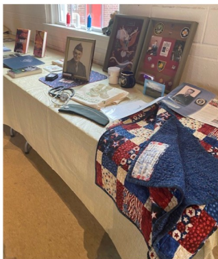
Veteran's Day was celebrated in the Parish Hall with a special display