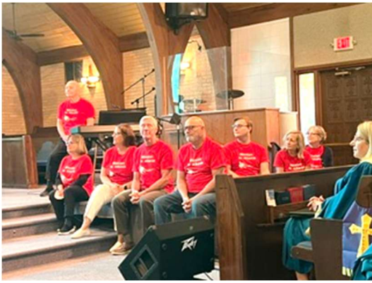
Shown above, St. Paul's Mission Team waits to give the congregation an update on their trip to Albania.