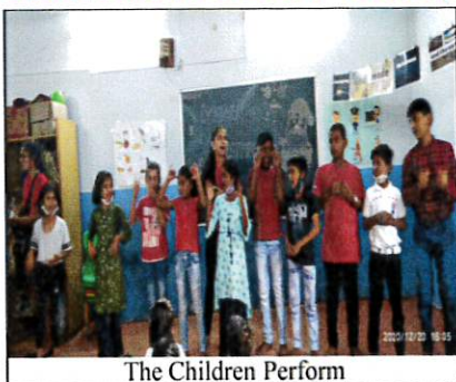
The Children Perform