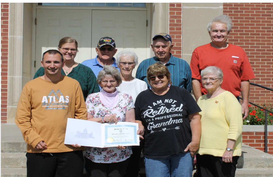
ATLAS volunteers were the recipients of the Governor's Volunteer Award in the Fall of 2023.

ATLAS is also blessed to have a great set of regular volunteers. These individuals help ATLAS with many tasks and their value cannot be overstated.